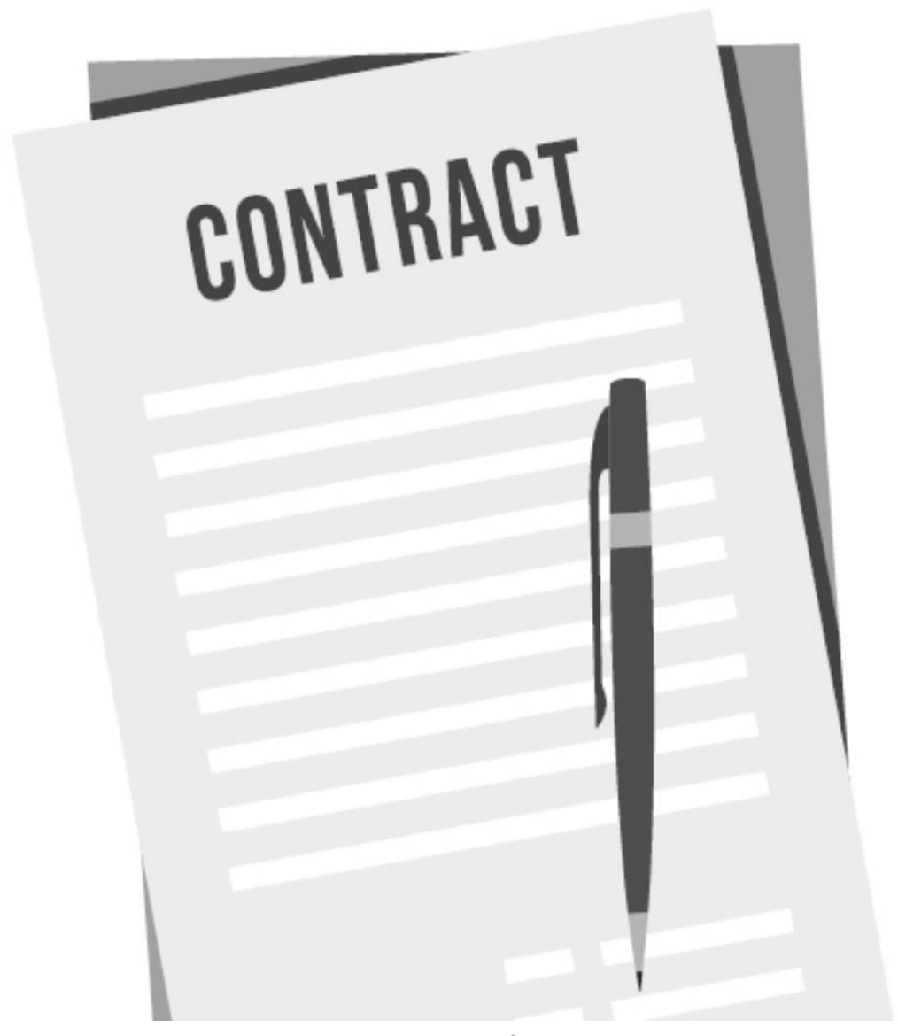
Page 28 of 45

Your landlord must provide you with a copy of this guide, so use the checklist and keep it safe to protect yourself from problems at every stage.