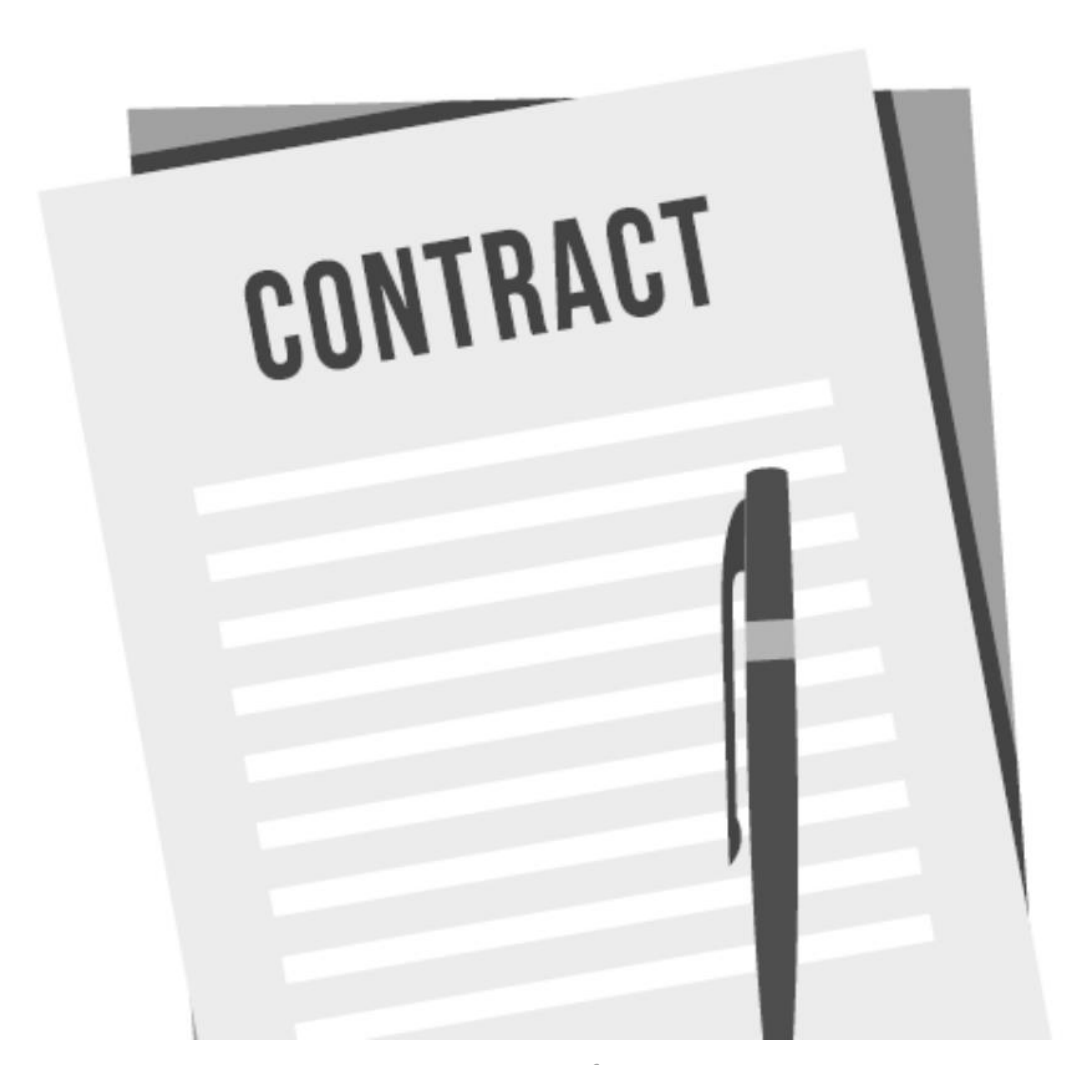
Page 39 of 45

Try to be present when the property is inspected to check whether any of the tenancy deposit should be deducted to cover damage. If you do not agree with proposed deductions contact the relevant <u>deposit</u> protection scheme.